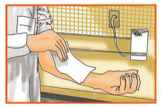
Cover 1st & 2st degree burns with a clean sterile dressing.