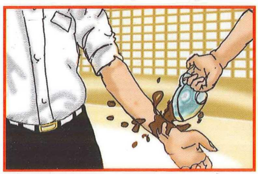
Stop the burning.

Do not remove any clothing stuck to a burn