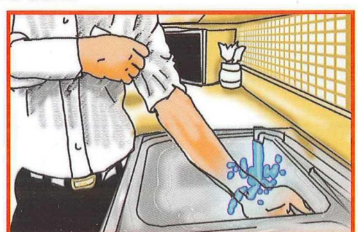
Cool with running water. Do not apply water to a 3<sup>rd</sup> degree burn. (NEVER USE BUTTER) (NEVER USE ICE)